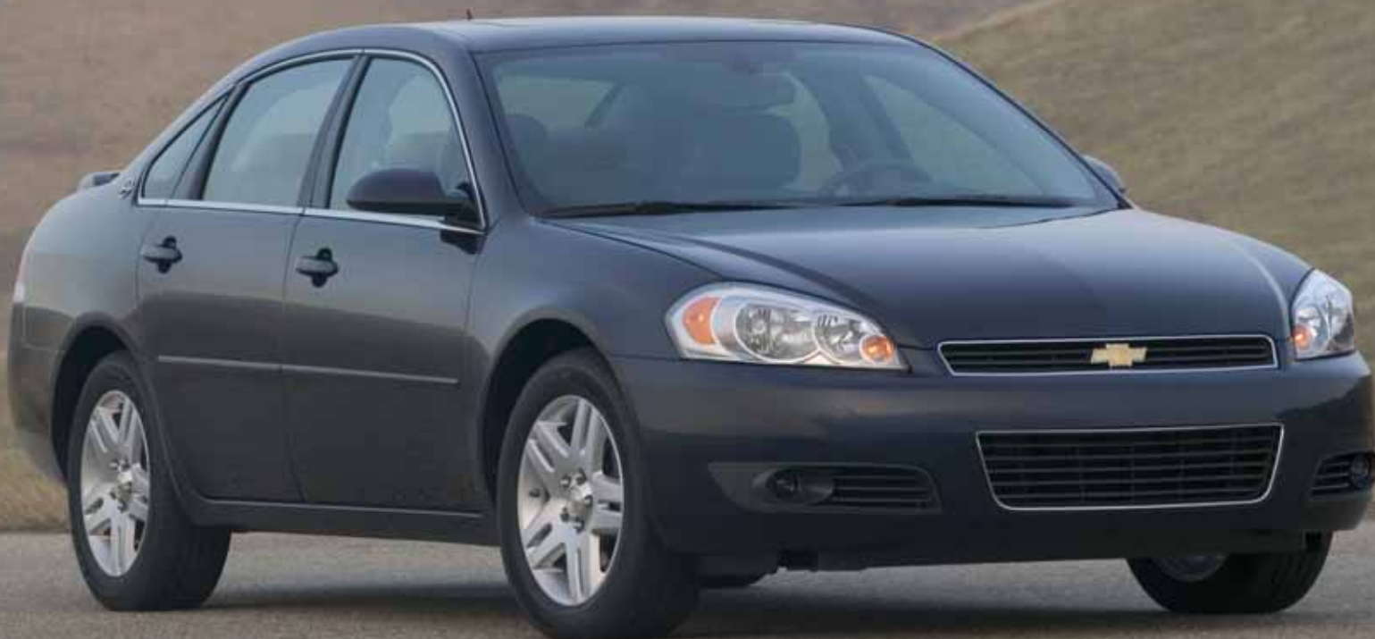
LTZ model shown