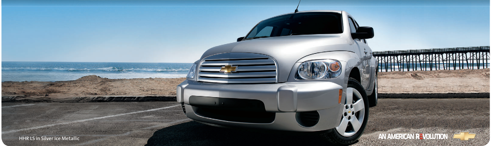
HHR LS in Silver Ice Metallic

HHR offers the best standard highway fuel economy in its class 1 with a surprising driving range of up to 512 miles, thanks to an EPA estimated 32 MPG highway. 2 A highly configurable interior provides the storage of a compact MPV; 3 the ride comfort of a car and a bold design that stands out from the crowd. The 2009 HHR earned five-star frontal and side-impact crash test ratings 3 and comes with standard side-impact air bags; 4 StabiliTrak Electronic Stability Control System (including Traction Control) and antilock brakes.